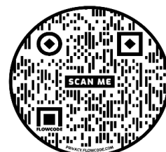
Scan for Deli Click & Collect