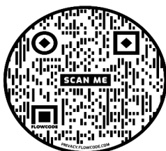
Scan for Takeaway